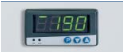
3.5" TFT-colour touch panel and independent, adjustable temperature limiter ( t_{min}/t_{max} )